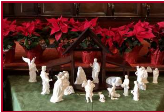
Dolores Shaw's Nativity Set