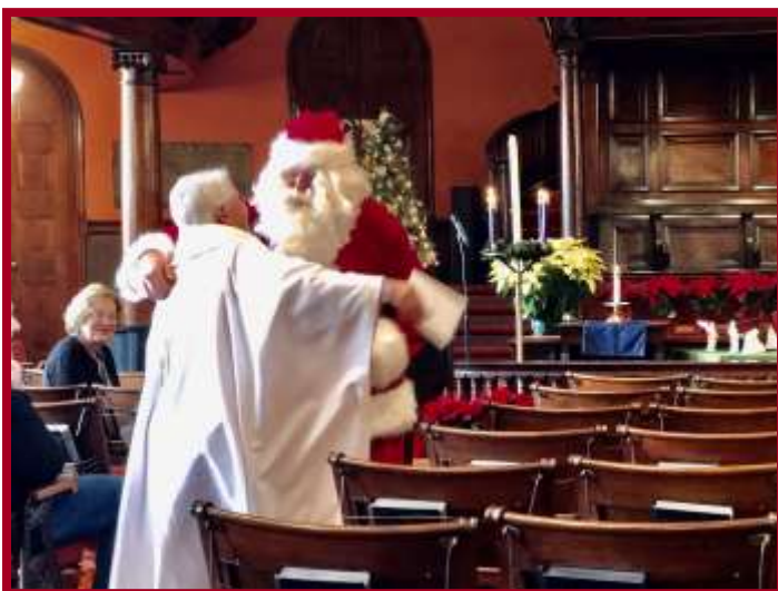
Santa visits LL UMC Staff