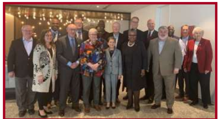
16 Member Mediation Team that produced the Protocol of Reconciliation and Grace through Separation