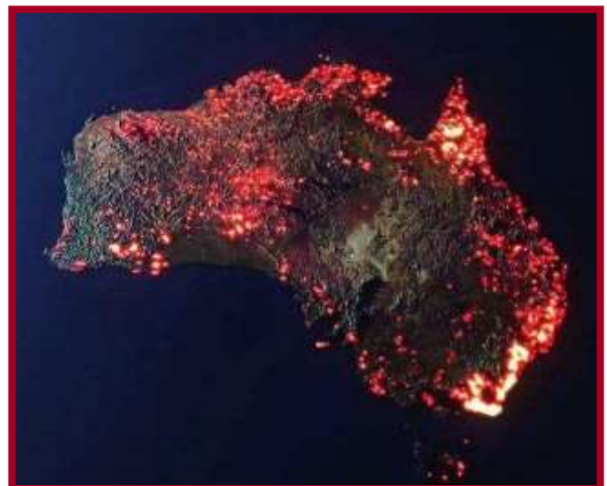
Australia on fire from space