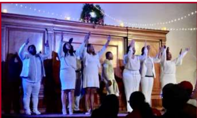
Camerata Baltimore Messiah Performance in the Chapel