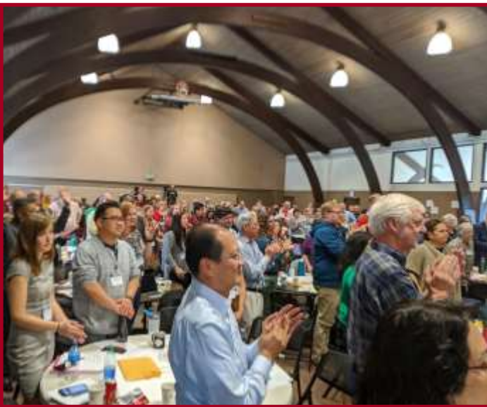
Western Jurisdiction Conference