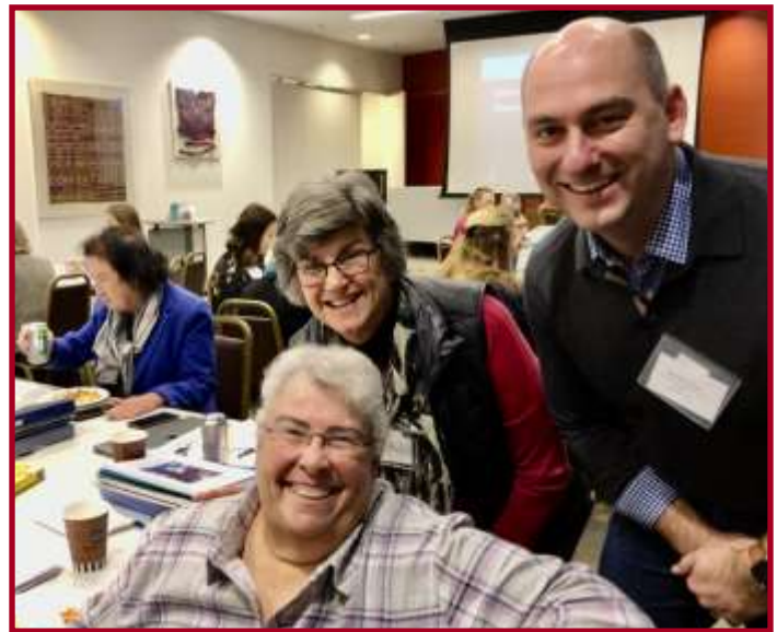
National Fund for Sacred Places Training