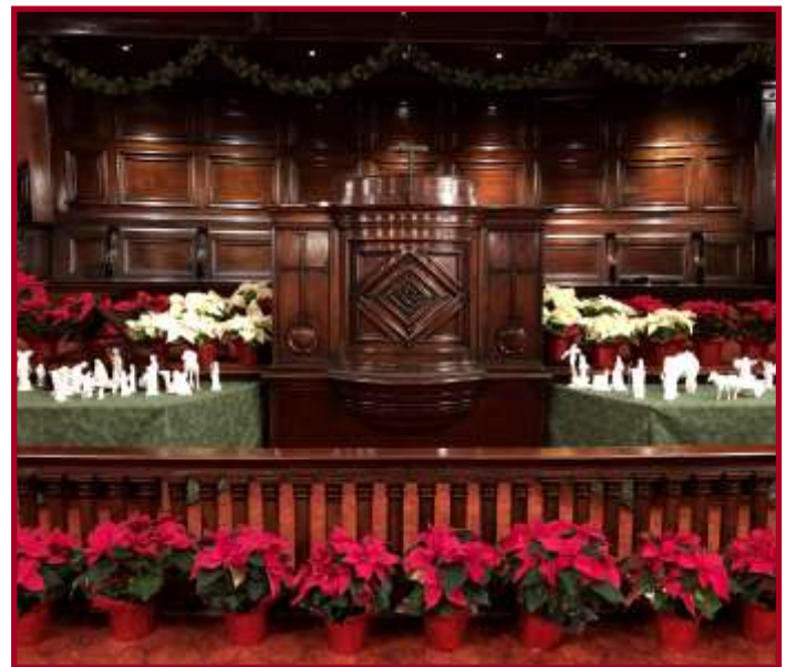
Poinsettias in Worship - December 22nd & Christmas Eve

Join us Christmas Eve, Dec. 24th as we welcome the Christ Child. Musical Prelude begins at 6:45pm, service with candles begins at 7:00pm.