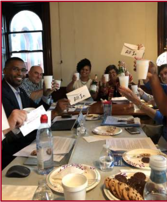
We celebrate the announcement of the National Trust Grant for Sacred Spaces with Maryland Strategic & our Study Team!